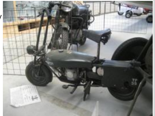
The Welbike was specially developed for airborne forces by the Research Station at Welwyn in Hertfordshire. The handlebars and saddle-pillar folded down onto central frame to allow easy storage into a CLE container. Which could then be dropped from the wing pylons of the C-47, or the Whitley, or any other machine which could hook a container on. One man could then lift it out of the container, unfold it and ride off within a few minutes of it landing. The Welbike was not a success however, as it was too small and the little wheels (12.5 inch) fell into potholes or stuck in shallow mud. The machines were found to be more useful in message carrying around the dispersed transit camps and mounting airfields. After the war they were marketed with some success as the "Corgi" civilian machine, and were given a two-speed box for road use. It bought into fashion the scooter.

I remember the Welbike being used by the army during the war when they occupied Bride Hall . The Welbike was specially developed for airborne forces by the Research Station at Welwyn in Hertfordshire. It was used during the war by the troops that were occupying Bride Hall .