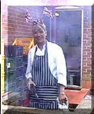
BBQ with a smile