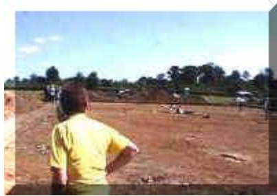
Some of the earthworks that could be seen