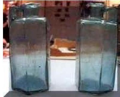
The picture on the left shows the state of excavation of a roman villas on 29 July 2003 - courtesy of John Murray .

Click on image to see larger version and click BACK on your browser to return here.