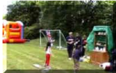
'Bouncy Castle' & 'Score a Goal'