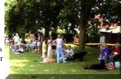
Shade for the competitors

If you would like to sponsor a dog in the NCDL's care or could offer a loving home to a dog in their care, please make contact.