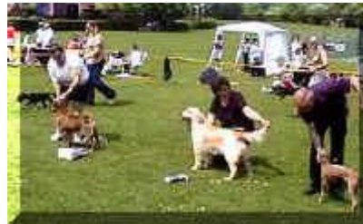
'Stand nicely for the judge!'