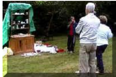
Smash The Crockery