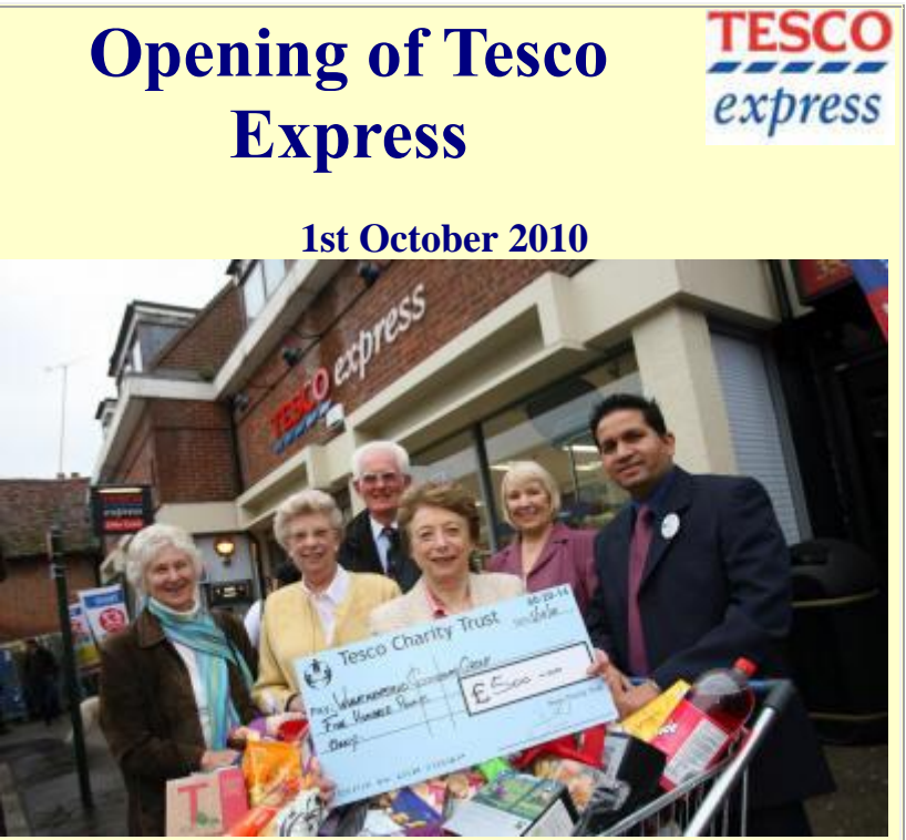
Presentation of £500 donation to Wheathampstead Community Group