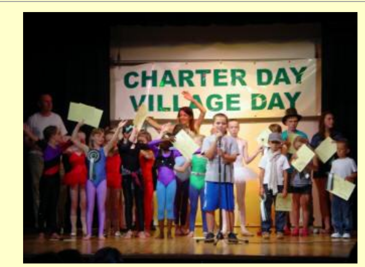
Wheathampstead's Got Talent

Wheathampstead Charter Weekend (1060-2010) - 10th and 11th July 2010 (organised by the Parish Council)