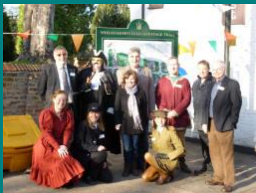
Initial launch in the High Street