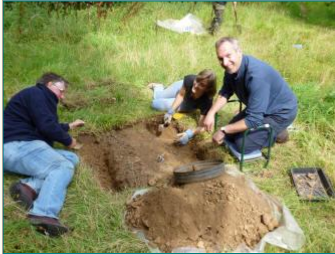
Dig at Bower Heath