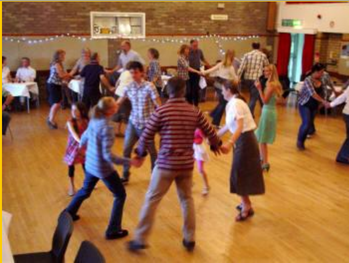
Village Barn Dance 9th July 2011