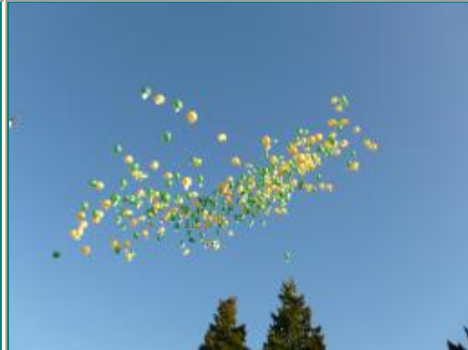
Sending our message far and wide