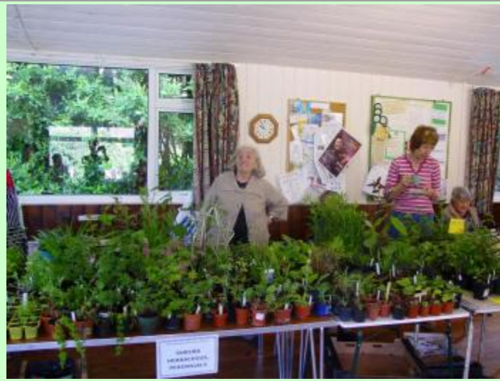
Horticulture Club Plant Sale