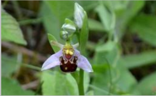
A Bee Orchid in flower in local nature reserve behind the new development on Butterfield Road .