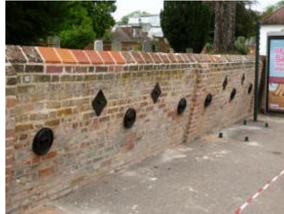
Stabilisation of St. Helen's Churchyard Wall August 2011