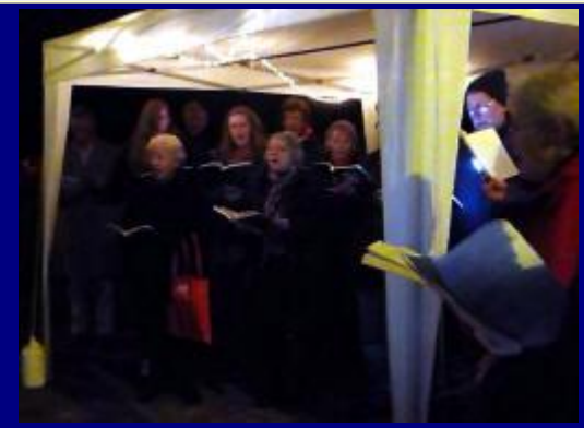
Wheathampstead Lights Switch-On - 25 Nov 2011