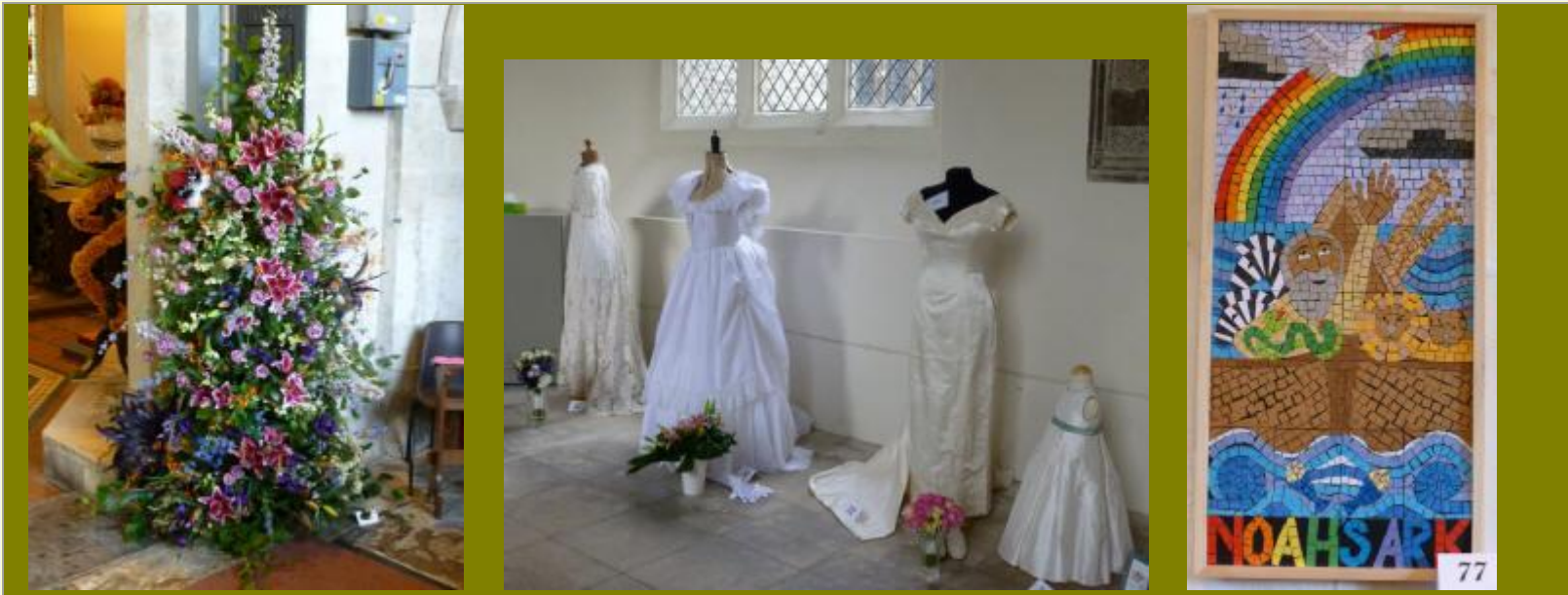
Wheathampstead Horticultural Society - Autumn Show 2011