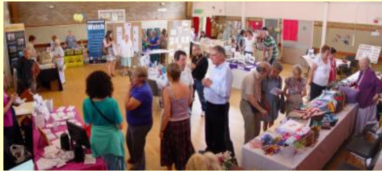
Business display in Hall