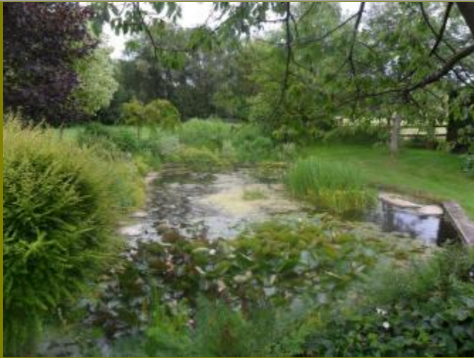
Horticulture Club visit to Hyde Hall 17th July 2011