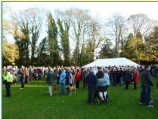
Speeches / festivities in Melissa Field