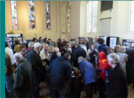
History Group Exhibition in St Helen's