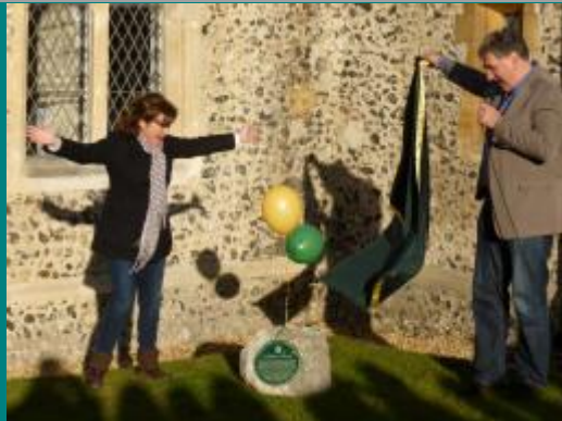
Official opening at St Helen's Church

Opened by Jim Carter (Mr Carson in Downton Abbey) and Imelda Staunton (Dolores Umbridge in Harry Potter)