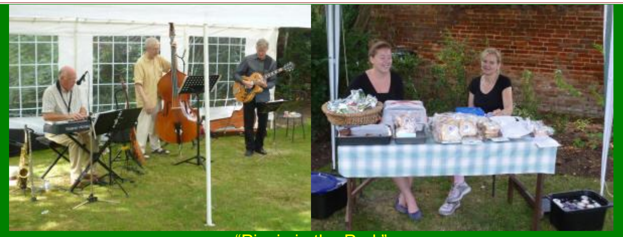
"Picnic in the Park" for Wheathampstead shop & office workers

Wed, 4th Sept In garden of Wheathampstead Place