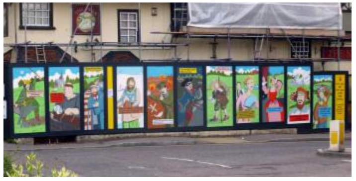
A Community Project organised by St Helen's Church