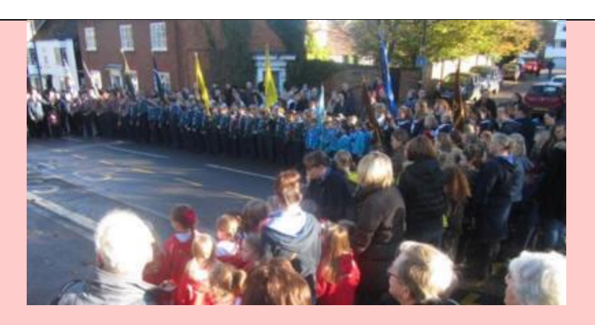
Remembrance Sunday 10th Nov. 2013