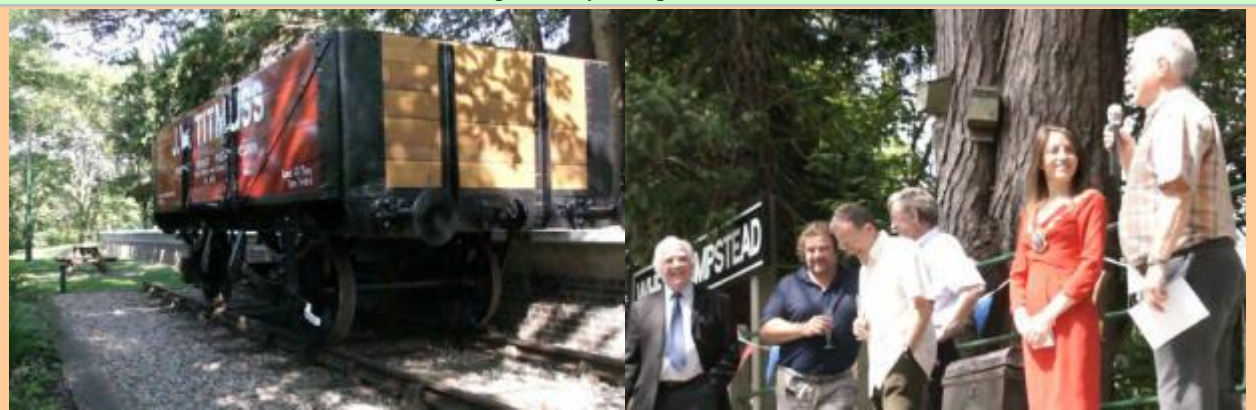
Official Launch of Station Platform and Truck