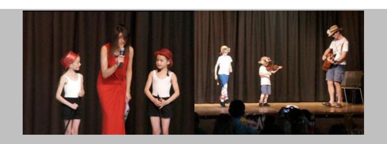
"Wheathampstead's Got Talent"