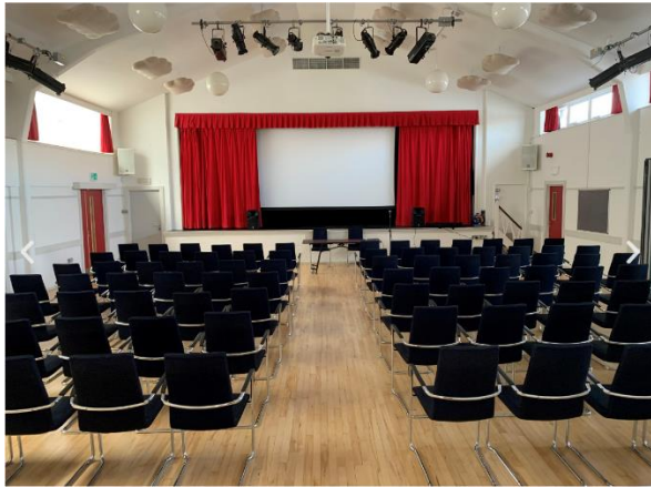
Main hall and stage