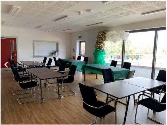
A meeting room