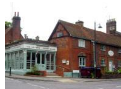
The view above was taken Sept. 2009.