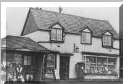
Post Office (1970?)