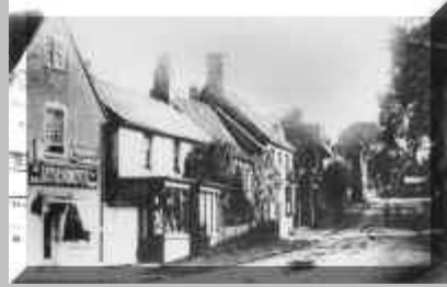
High Street - East